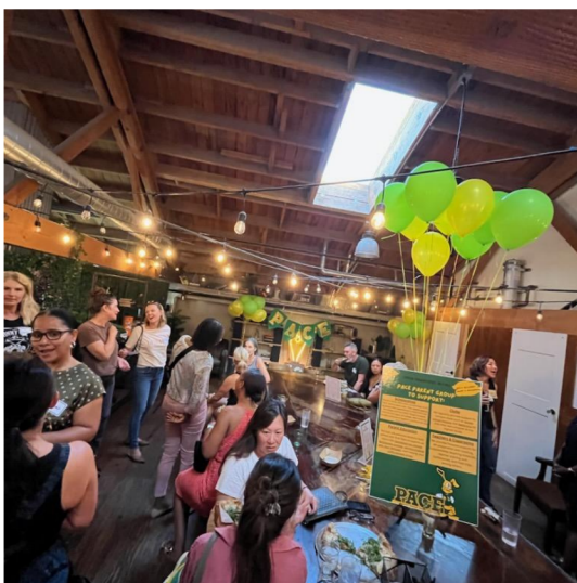
PACE parent mixer on August 27 at the Beer Lab.