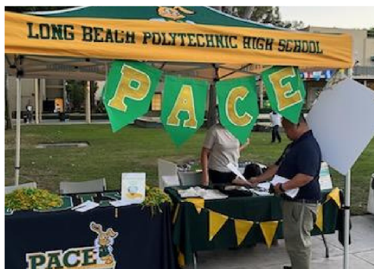
Top: PACE Taco Tailgate at the Poly Homecoming game.