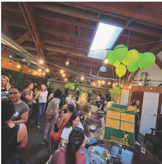
PACE parent mixer on August 27 at the Beer Lab.